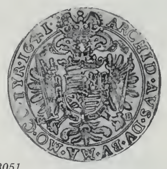
Lot No. 3051

3051 Ferdinand III, 1627-1657. 5 Ducats, 1641 KB. Kremnitz. Obv. Bust, r., with falling lace collar. Rv. Imperial Arms with the Hungarian escutcheon on the breast. Struck with Half Taler dies. 35mm, 17.277 grams. Not listed by Friedberg. Extremely Fine and attractive. (SEE COLOR PLATE) (4,000-4,500)